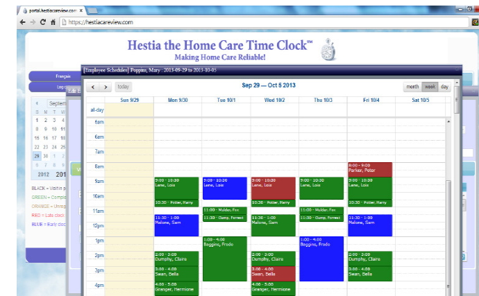
View schedules by Month, Week or Day