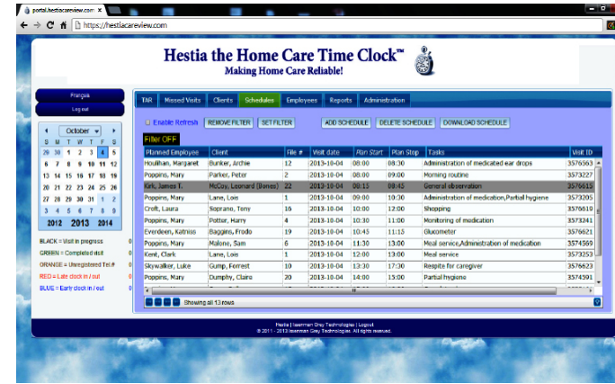
Access your schedules from anywhere